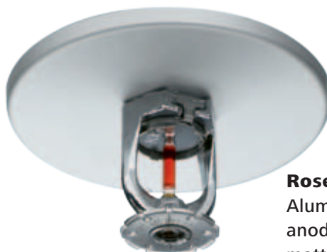
Rosette D Aluminium, anodised matt silver