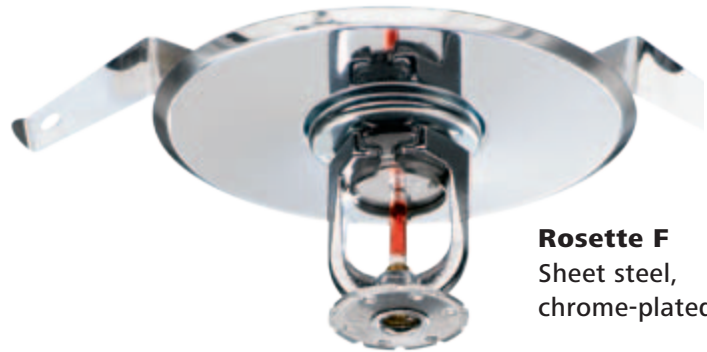
Rosette F Sheet steel, chrome-plated