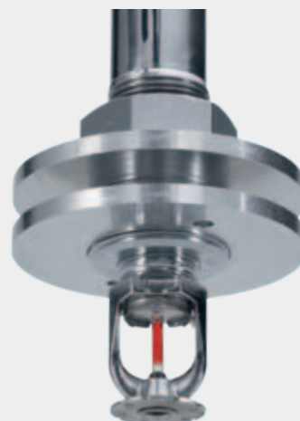
Special rosette To cover the openings made in sheet metal and cleanroom ceilings in a decorative and pressure- tight manner.