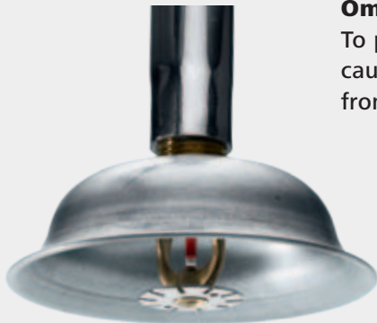
Omega water shield To prevent against cooling caused by water discharge from other sprinklers.