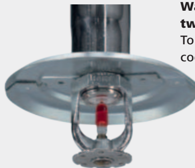
Water shield, two-part To protect against cooling and the sprinkler getting wet; can be retrofitted.