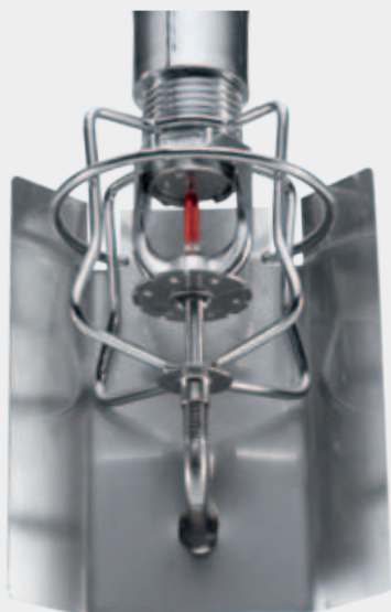
Guard with deflector plate To limit water distribution when certain objects (such as deep fryers) must not get wet.