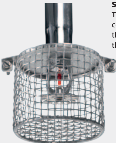
Sprinkler cage To catch the sprinkler cone and large shards of the glass bulb when the sprinkler is released over devices such as paper machines.