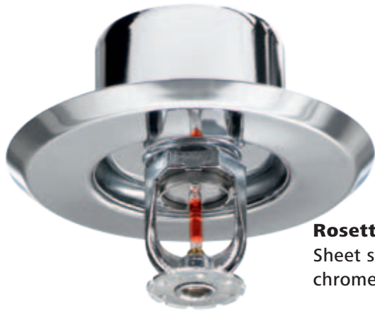
Rosette E Sheet steel, chrome-plated