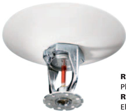
Rosette A Plastic, white Rosette G Elastomer, white

Rosettes in a variety of designs and colours can be used to decoratively cover the openings made in suspended ceilings when sprinklers are installed.