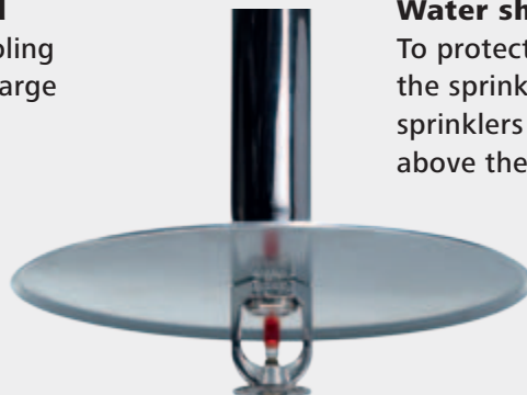
Water shield To protect against cooling and the sprinkler getting wet when sprinklers are mounted one above the other, for example.