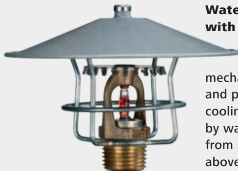
Water shield with guard To protect against mechanical damage and prevent cooling caused by water discharge from sprinklers above.