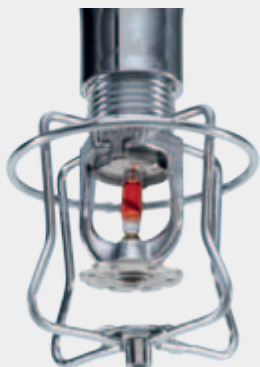
Sprinkler guard To protect against mechanical damage.